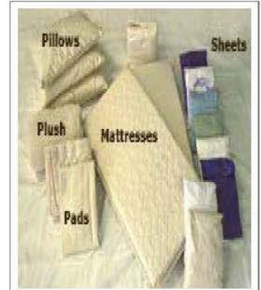
Co Sleeper Bedding 25.5 x 36.5"