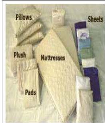
Baby Bunk Bedding 15 x 35"