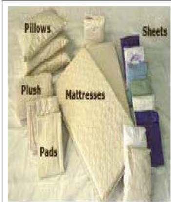
Mini Stokke Bedding