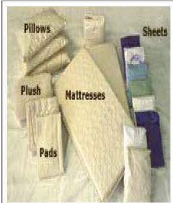
Small Cradle Bedding 15 x 33"