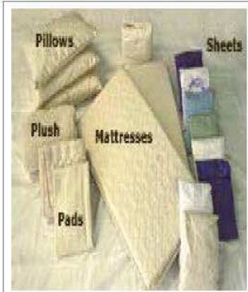
Mini Co Sleeper Bedding 18x31"