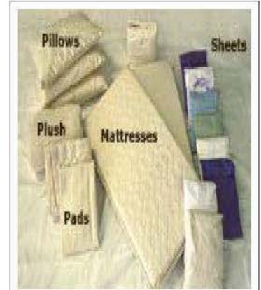
Small Basket Bedding 10 x 29"