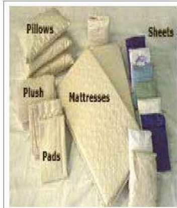
Cradle 18 x 36" Bedding