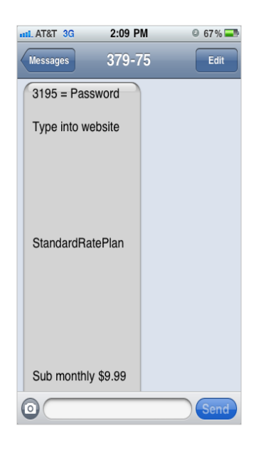
Middle of Message

Monitoring and Enforcement. Although the MMA first assembled the set of best practices that became known as "guidelines" for the industry, it has no role in monitoring industry participants to