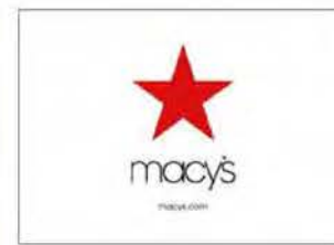
9 With any $32.50 Lancôme purchase.