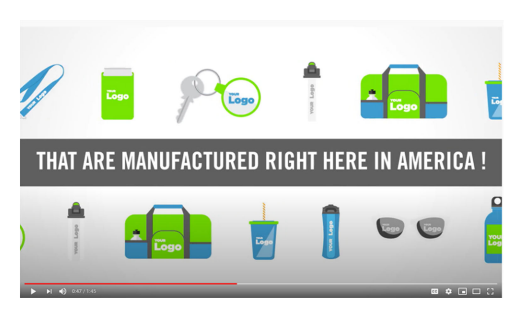
(Exhibit D, Brandnex YouTube Video).