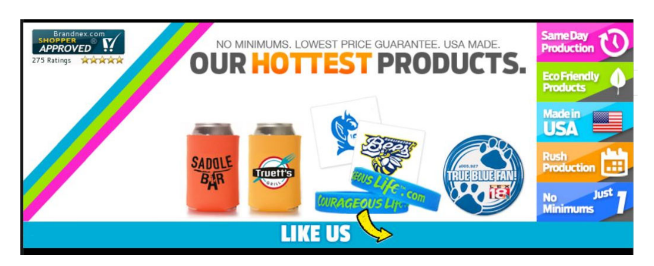
(Exhibit C, Brandnex Facebook Header)