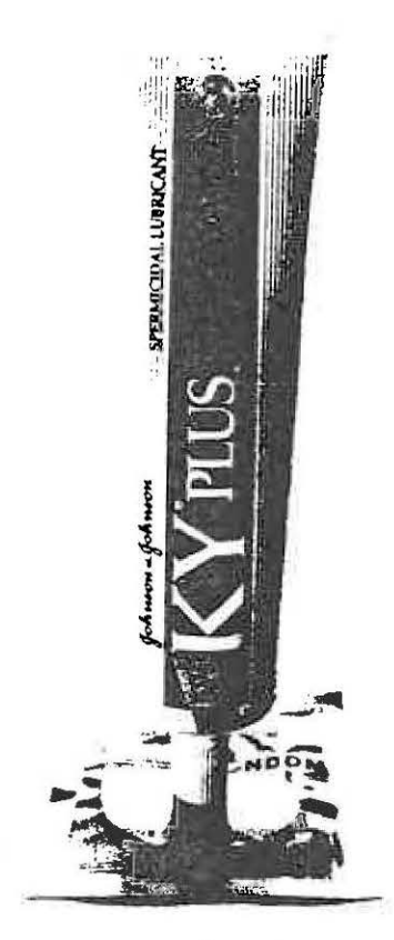
Introducing condom insurance.

ew K-Y* Plus, because one out of six condoms fails. Anyone can make a mistake, or a condom can develop tiny holes during use — invisible to the eye, but big enough for sperm, HIV and other viruses to pass through. So new K-Y* Plus Brand with Nonoxynol-9 just makes good sense for personal lubrication. It provides double protection.