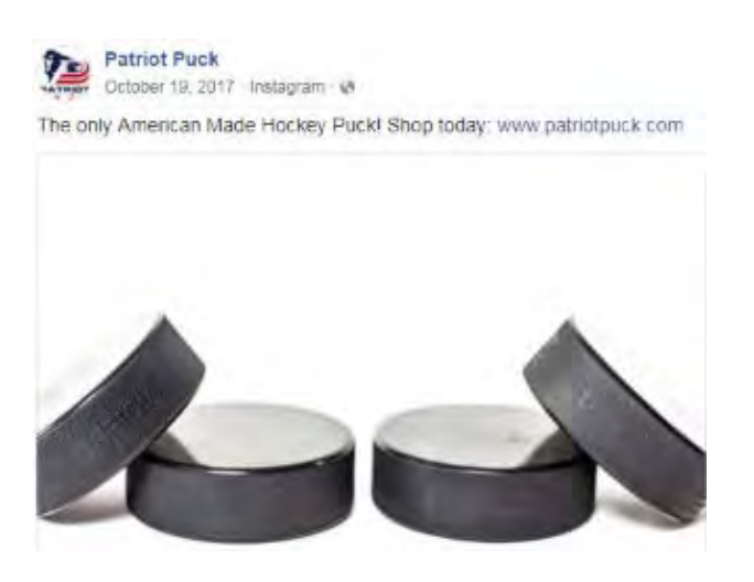
(Exhibit D, Patriot Puck Facebook posting); and

D. "The only American Made Hockey Puck!"