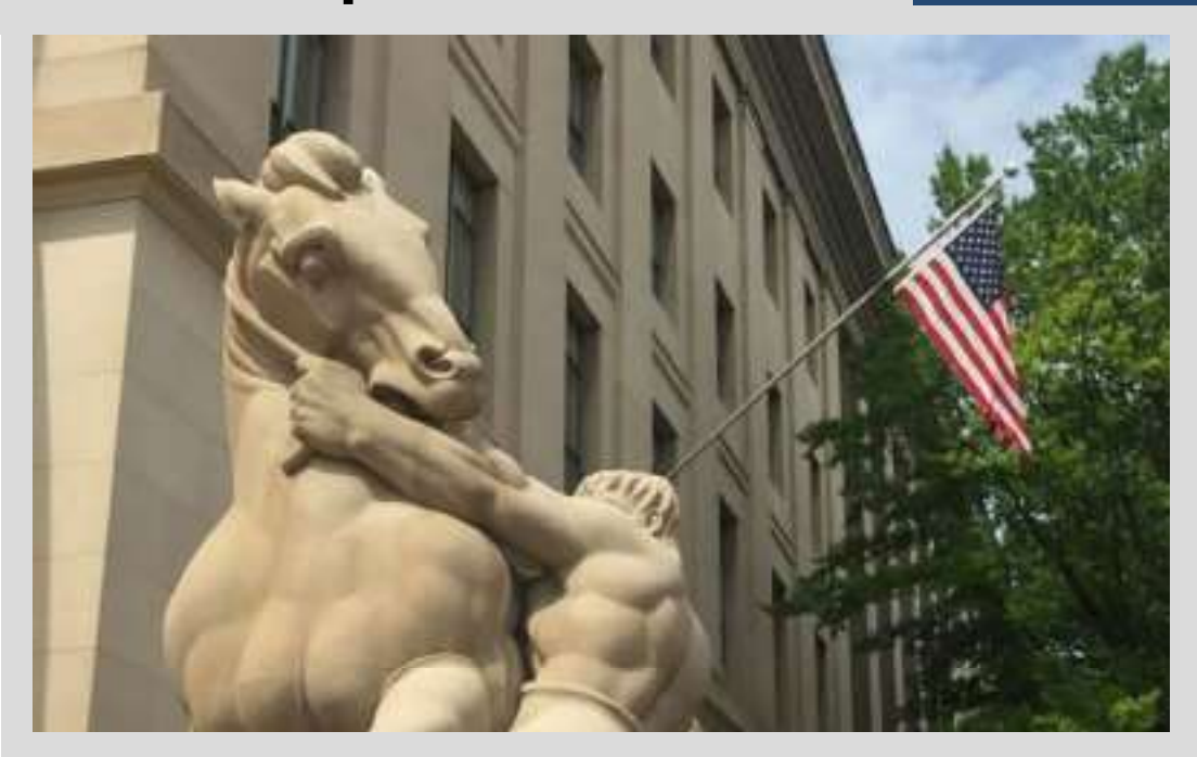
Semiannual Report to Congress October 1, 2021–March 31, 2022