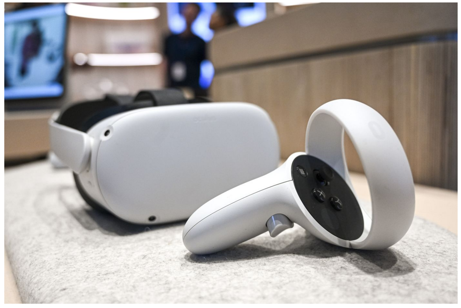
A Meta Oculus Quest 2 VR headset at a Meta Store in Burlingame, California.