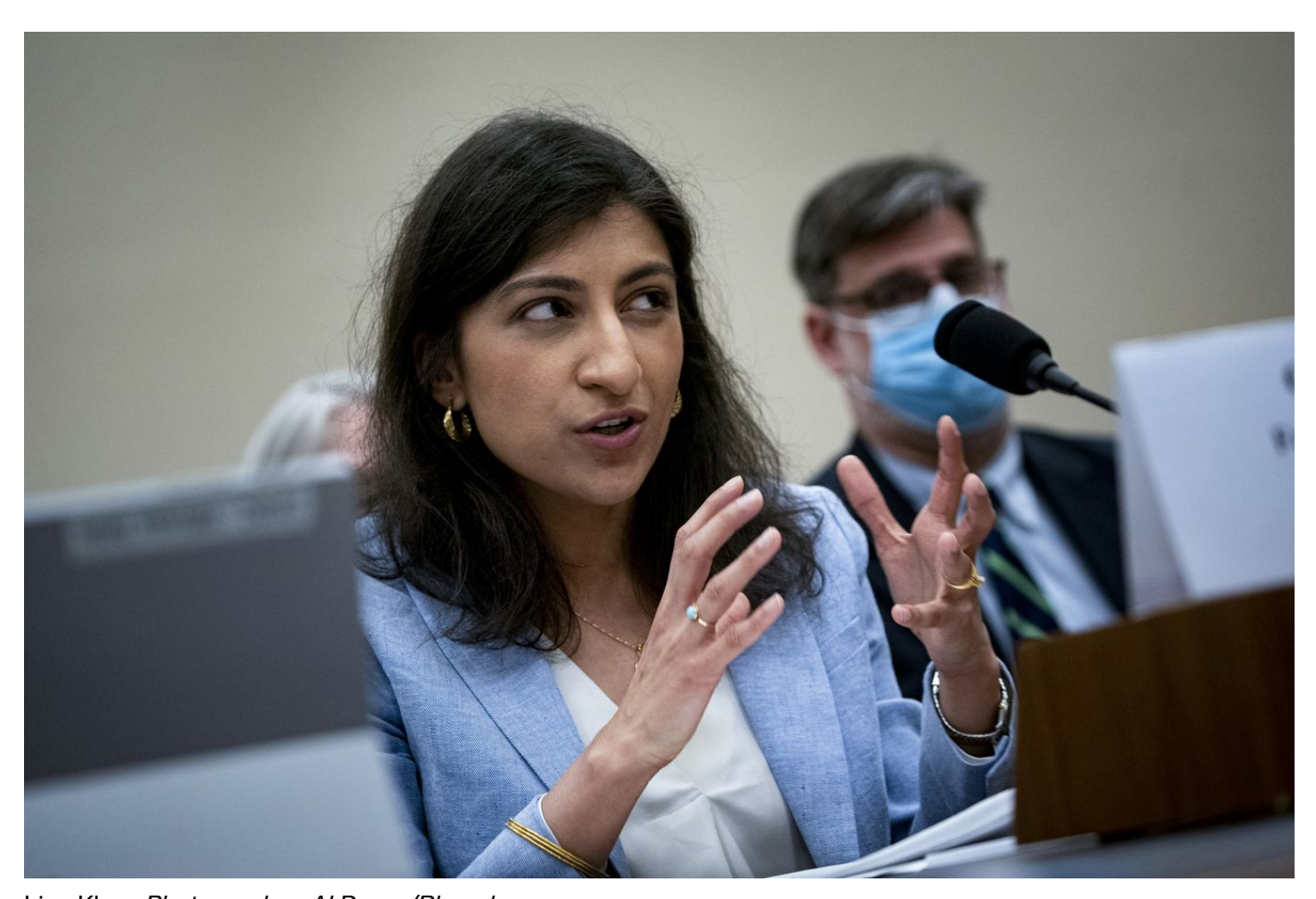
Lina Khan