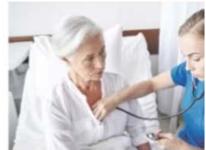
Diet rich in DNA methylation and he