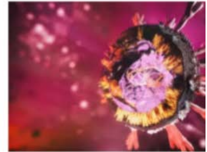
New strategy to contain COVID-19 d